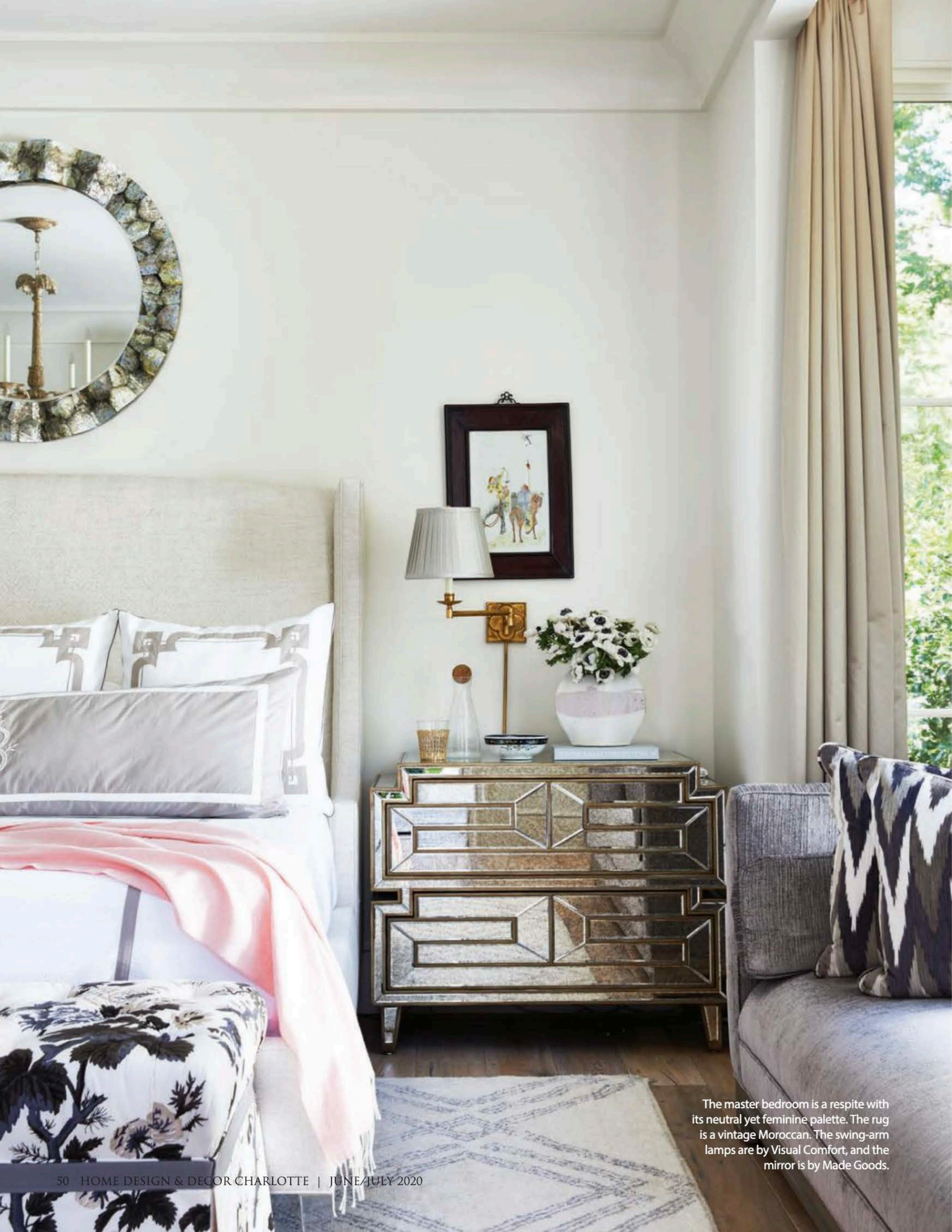
The master bedroom is a respite with its neutral yet feminine palette. The rug is a vintage Moroccan. The swing-arm lamps are by Visual Comfort, and the mirror is by Made Goods.

TOP: In the master bath, the Schumacher drapes offer some privacy as well as interest, while the sconces by Visual Comfort add the understated touch of light.