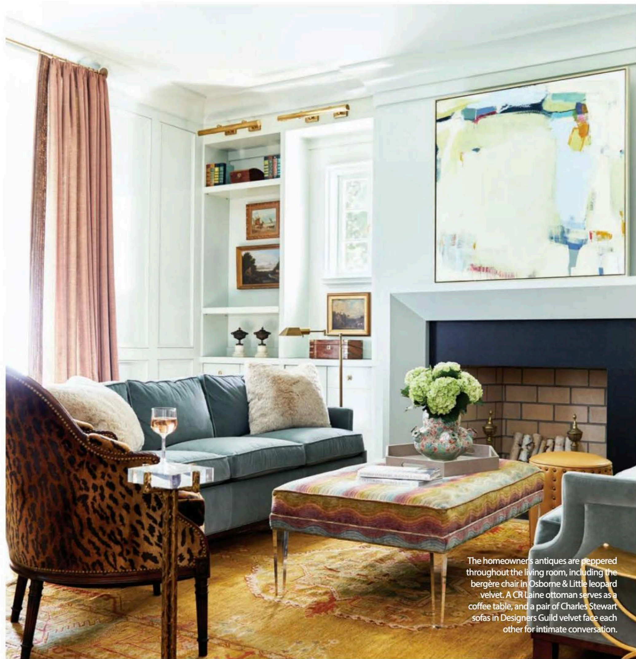
The homeowner's antiques are peppered throughout the living room, including the bergère chair in Osborne & Little leopard velvet. A CR Laine ottoman serves as a coffee table, and a pair of Charles Stewart sofas in Designers Guild velvet face each other for intimate conversation.

"We really wanted our home to be warm and inviting but also elegant and full of the heirlooms I love." A third-generation native Charlottean, the homeowner had many antique pieces that had been passed down through the years. "I've always loved pretty things, from dressing to decorating, and I just wanted that to drip into my home. But in a livable way," she says.